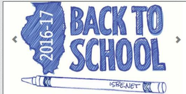
Back to school tips for families and administrators